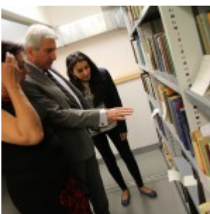
A tour of the book depository of the Jan Palach Library